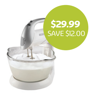
Black + Decker Stand Mixer