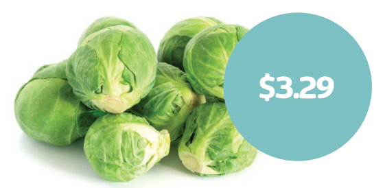
Brussels Sprouts 16 oz., Bags