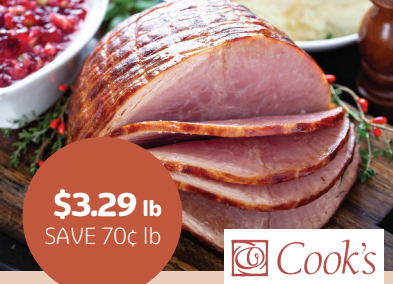
Cook's Smoked Ham Portions Butt or Shank