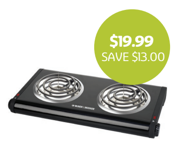
Black + Decker Double Burner ea., Black