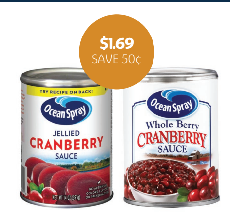
Ocean Spray Cranberry Sauces 14 oz., Selected Varieties