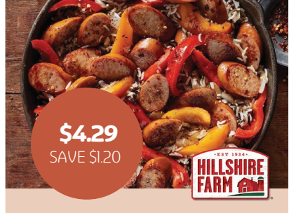
Hillshire Farm Smoked Sausages 14 oz., Selected Varieties