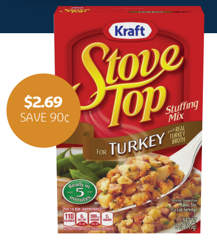
Kraft Stove Top Stuffing Mix 6 oz., Selected Varieties