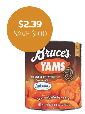
Bruce's Yams 29 oz.