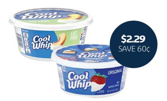
Cool Whip Topping 8 oz., Fat Free or Original