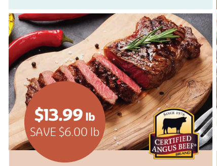
Boneless Striploin Steaks Certified Angus Beef