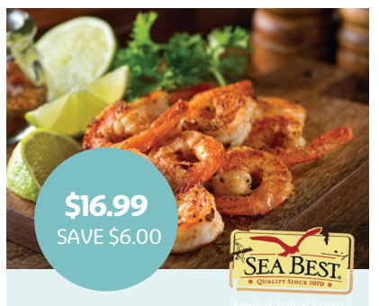
Sea Best Raw Shrimp 32 oz., 16-20 ct., Easy Peel