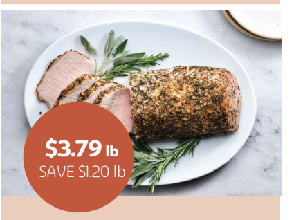
Pork Tenderloin USDA Inspected