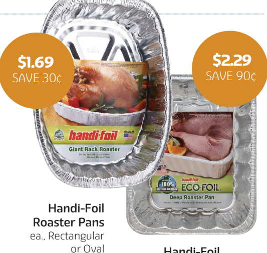
Handi-Foil Deep Roaster Pan | ea.