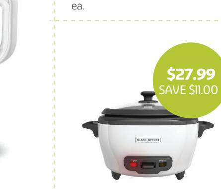
Black + Decker Food Processor ea. Black + Decker Rice Cooker & Steamer