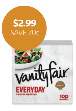
Vanity Fair Napkins 100 ct.