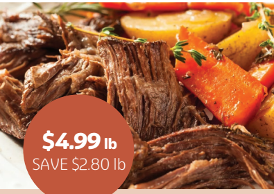
Beef Boneless Chuck Roast USDA Choice