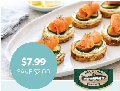
Ducktrap Spruce Point Smoked Salmon 4 oz., Selected Varieties