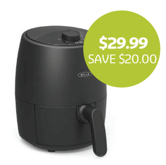
Bella Air Fryer 2 qt., Black