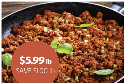
93% Lean Ground Sirloin Ground Fresh Several Times Daily