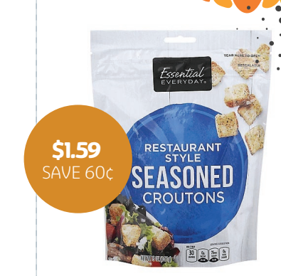
Essential Everyday Croutons