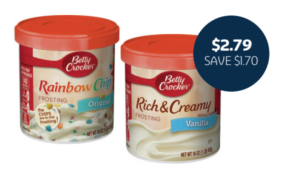
Betty Crocker Frostings 16 oz., Selected Varieties