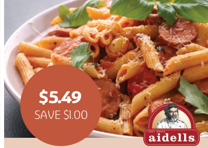
Aidells Smoked Sausages 12 oz., Selected Varietiees