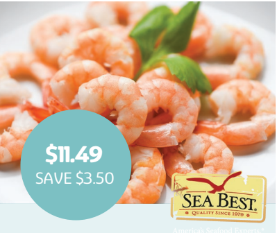
Sea Best Cooked Cocktail Shrimp 16 oz., 16-20 ct., Tail-on