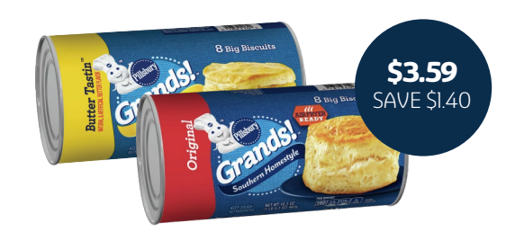
Pillsbury Grands! Biscuit Dough 16.3 oz., Selected Varieties