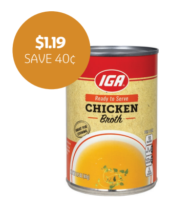
IGA Chicken Broth 15 oz., Ready to Serve