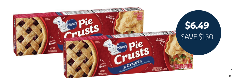
Pillsbury Pie Crusts 14.1 oz., Selected Varieties