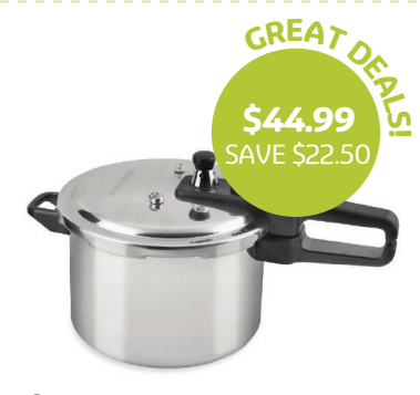
Oster Pressure Cooker