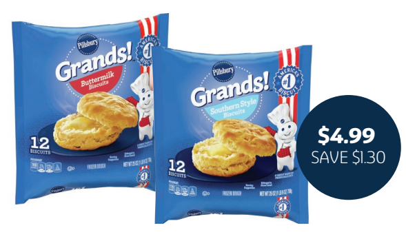
Pillsbury Grands! Frozen Biscuits 25 oz., Buttermilk or Southern Style