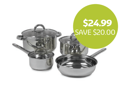
Sedona Non-Stick Cookware Set 7 pc.