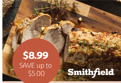
Smithfield Pork Tenderloin for Fillets 18-27 oz., Seasoned, Selected Varieties