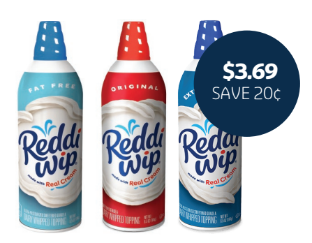
Reddi Wip Aerosol Whipped Cream 6.5 oz., Selected Varieties