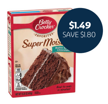
Betty Crocker Cake Mix 15.25 oz., Selected Varieties