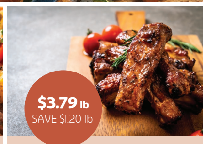
Pork Back Ribs USDA Inspected